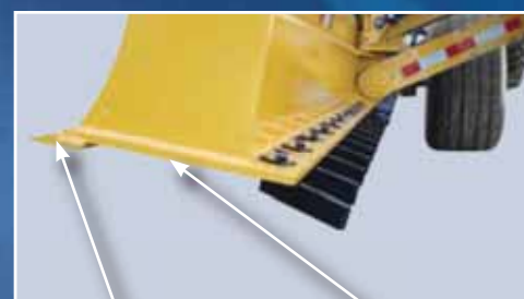
Industrial-type cutting edge