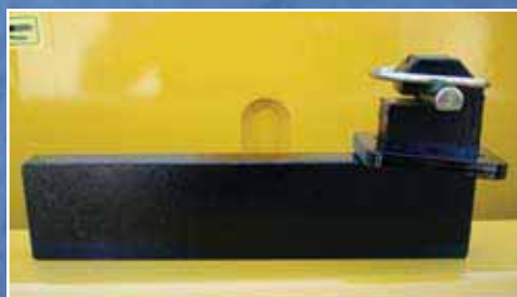
Hardox 450 removable finishing teeth with storage compartment