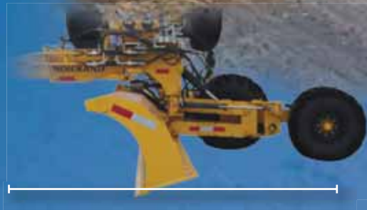
Blade angle adjustment - horizontal (from 15 to 30 degrees)