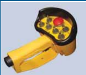
Wireless control with radio frequencies