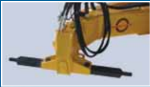
Dual-axis pivoting hitch