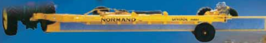
Blade angle adjustment - vertical