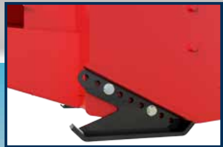
ADJUSTABLE CARBON STEEL ANGLE SKID SHOES