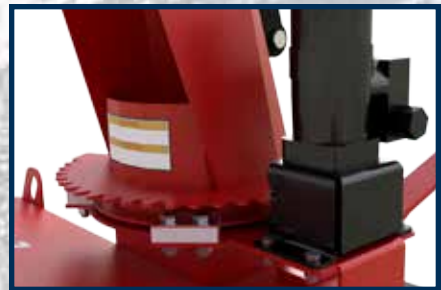
CHUTE ROTATION ON POLYETHYLENE UHMW