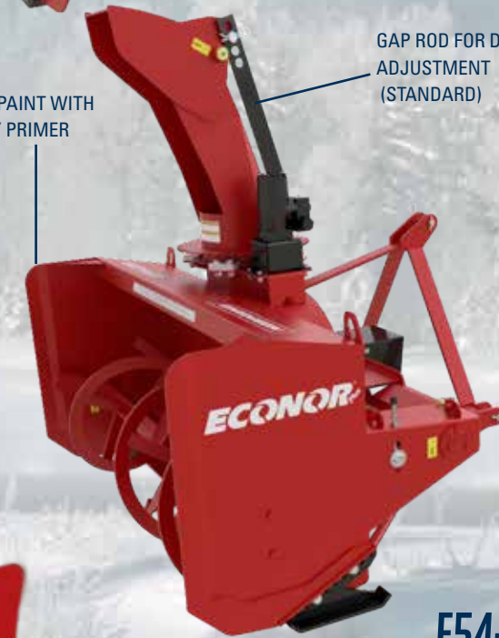
GAP ROD FOR DEFLECTOR ADJUSTMENT (STANDARD)