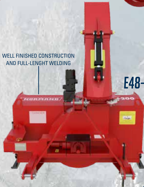
WELL FINISHED CONSTRUCTION AND FULL-LENGTH WELDING