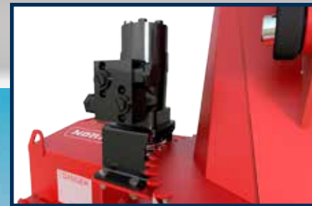
HYDRAULIC CHUTE ROTATION BY MOTOR WITH CUSHION VALVE (OPTION)