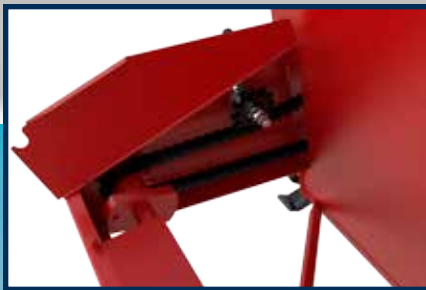
SAFETY BOLT ON DRIVING SHAFT AND CHAIN BENDER